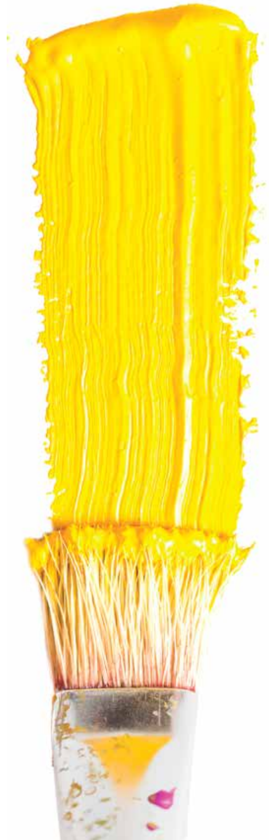
Worldwide Production of Paint & Paint Materials in 2018